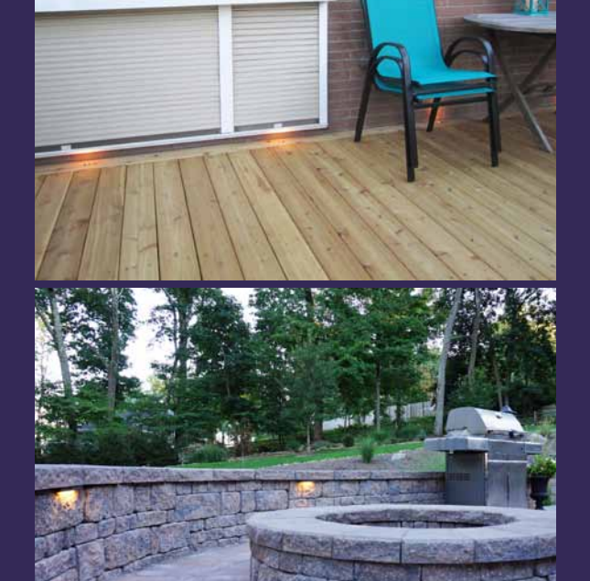
Great for concrete, wood, decks, steps, paths, gates, fences and driveways.